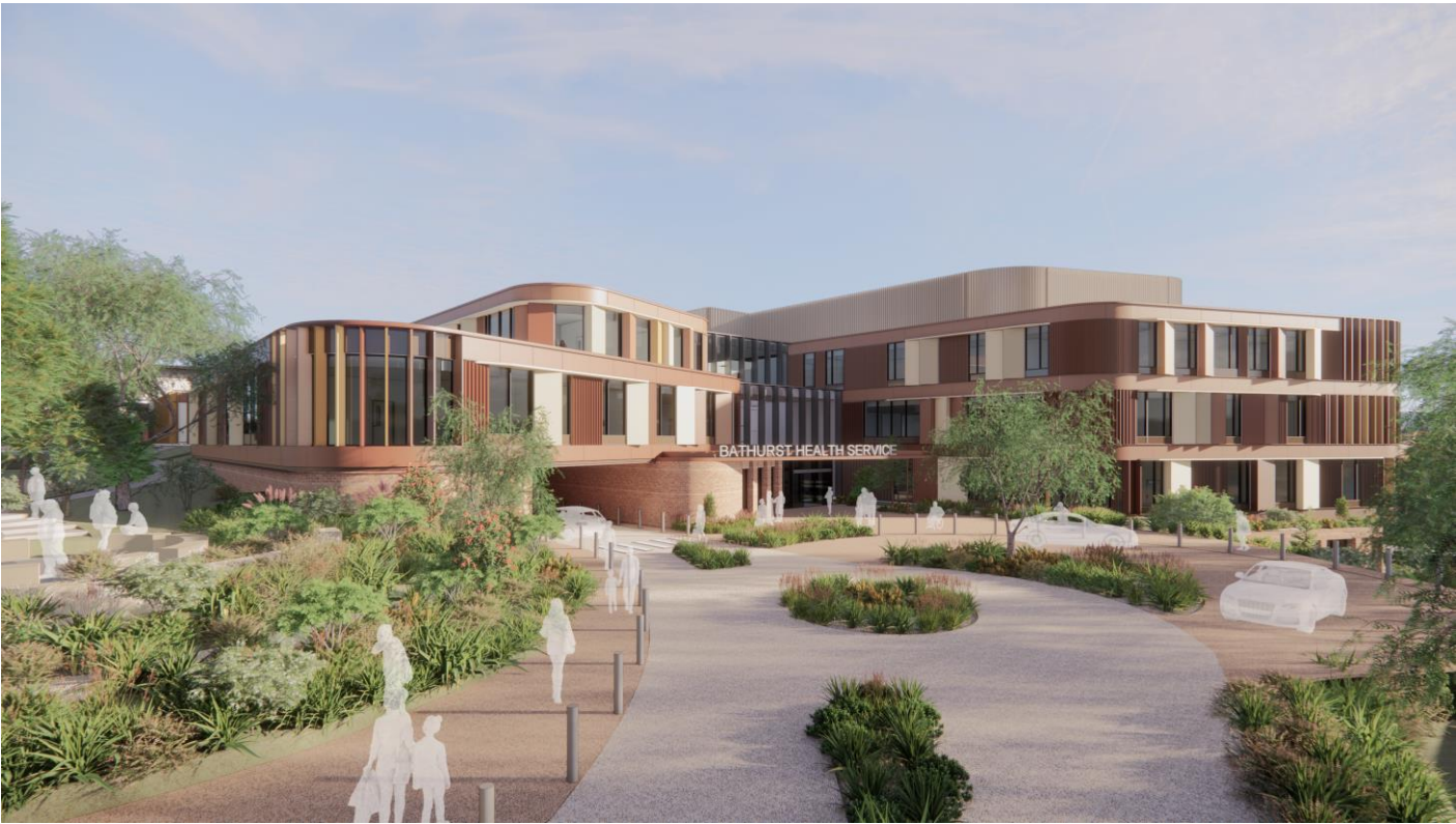
Artist Impression Mitre Street Entrance