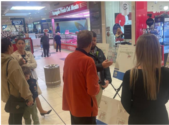
Concept design consultation