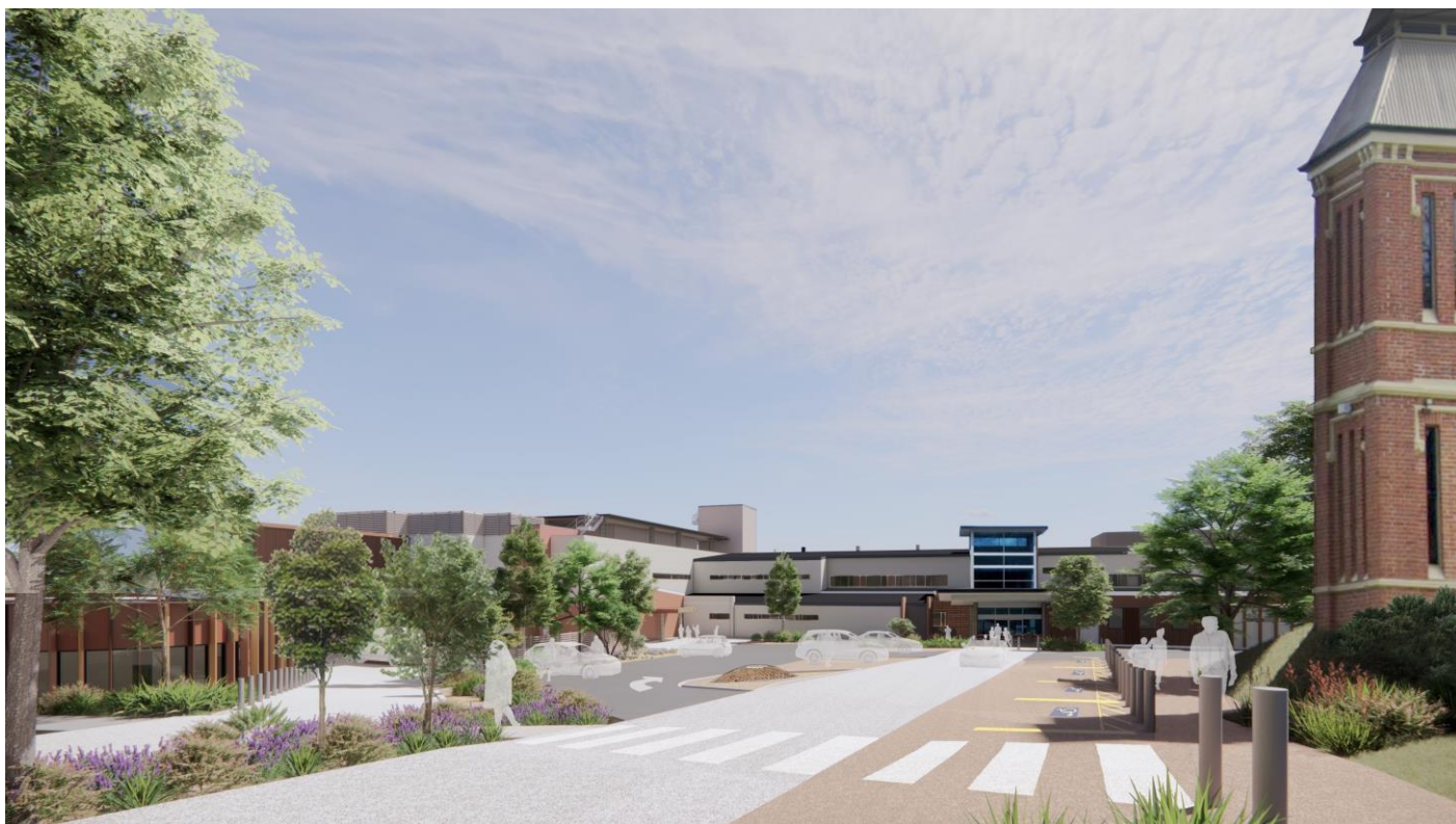
Artist Impression Howick Street Entrance