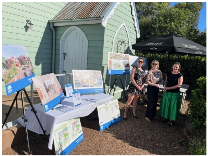
Schematic design consultation