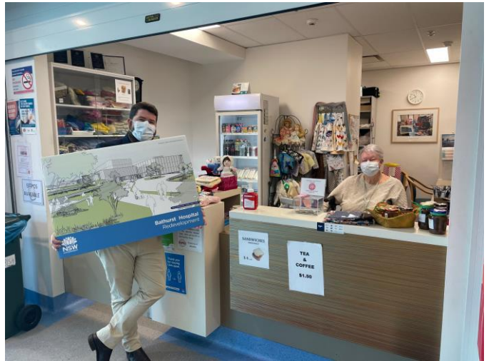
Concept design consultation