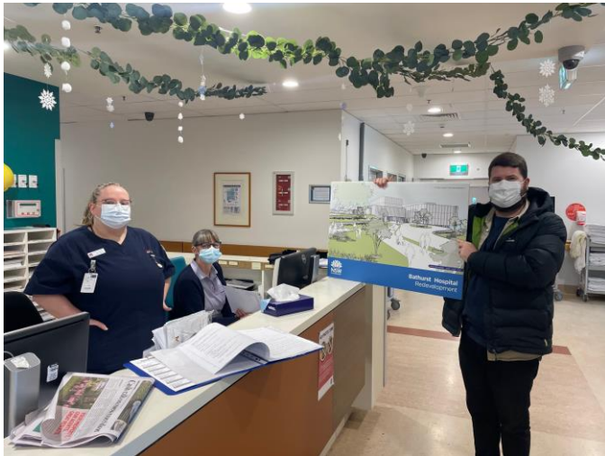
Concept design consultation