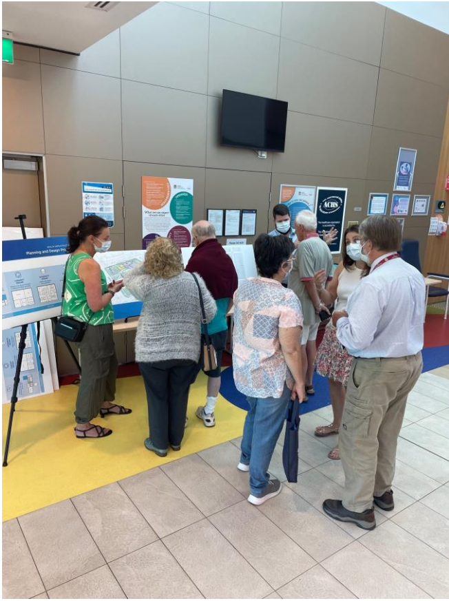
Master plan consultation