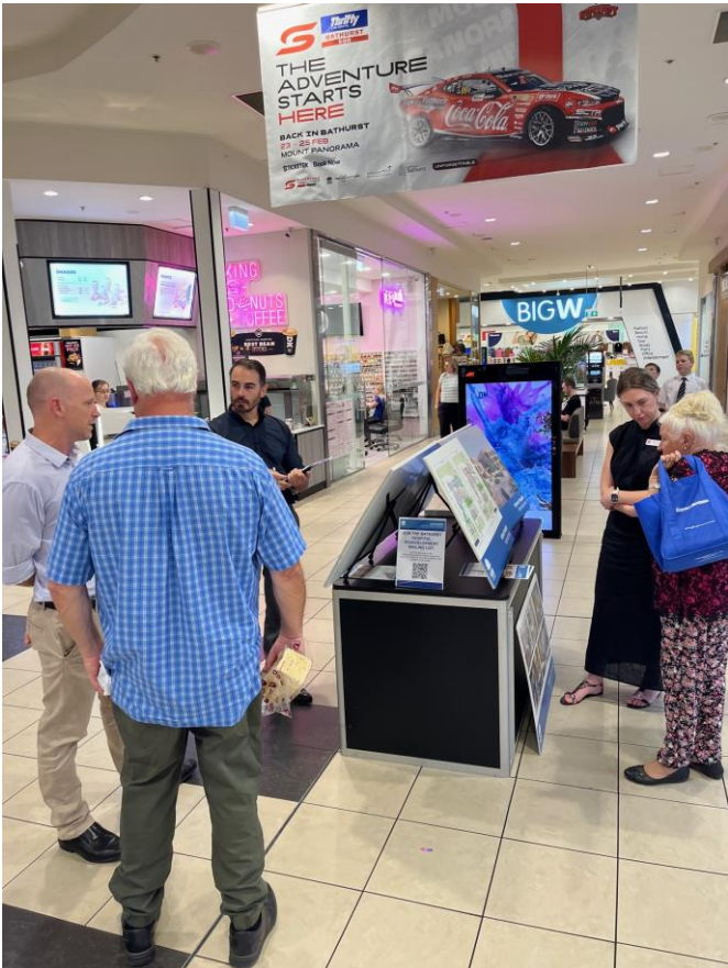
Schematic design consultation