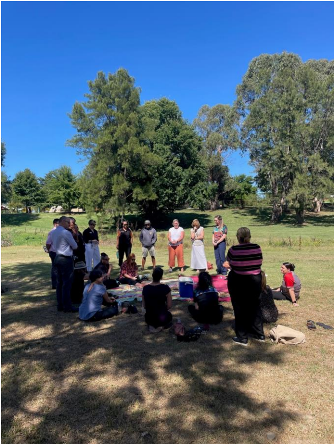
Walk on Country