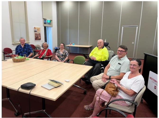
Community Reference Group