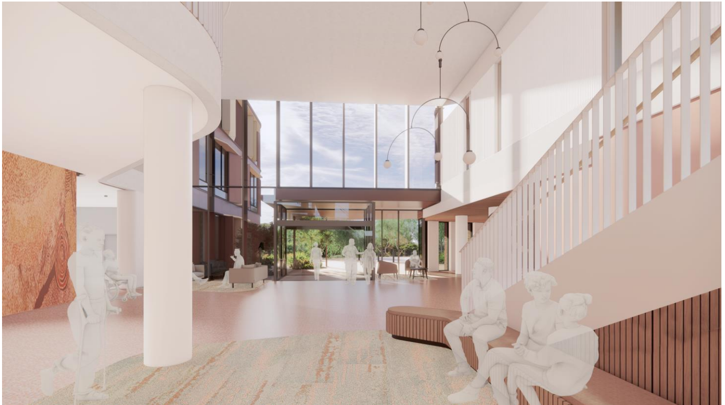
Artist Impression Mitre Street Main Entrance Foyer

The Bathurst Hospital Redevelopment engagement has helped the project team understand and identify potential issues and develop mitigation measures to address them.