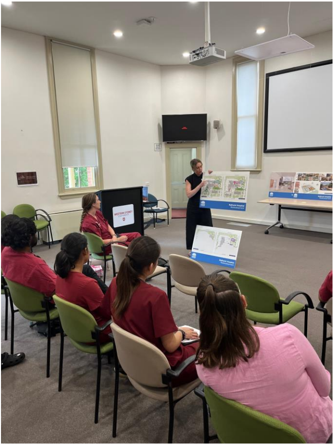
Schematic design consultation