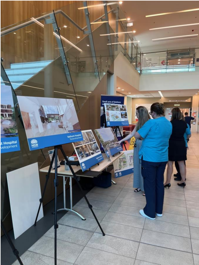
Schematic design consultation